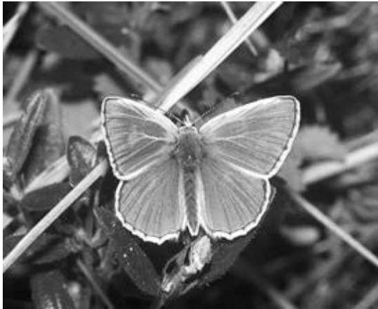
Common Blue ( Polyommatus icarus )