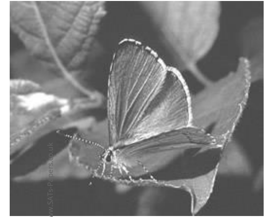
Holly Blue ( Celastrina argiolus )