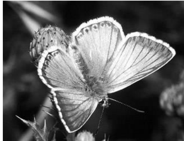
Chalk Hill Blue ( Polyommatus coridon )