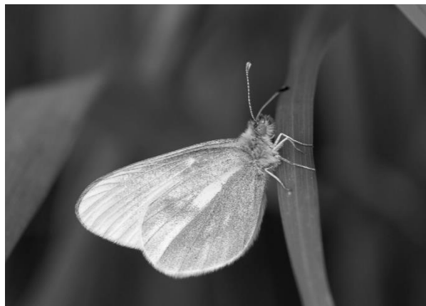
Cryptic Wood White ( Leptidea juvernica )