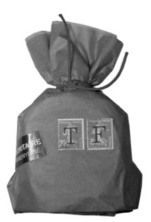
A strange shaped parcel