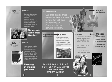
The Midhampton Museum leaflet