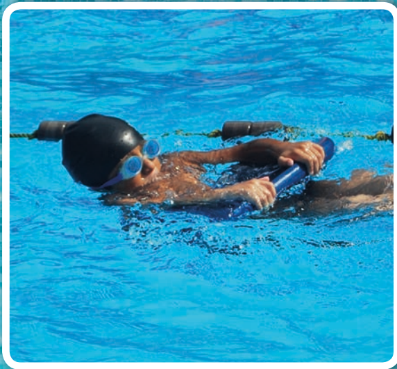
Sea Spray Swimming Pool