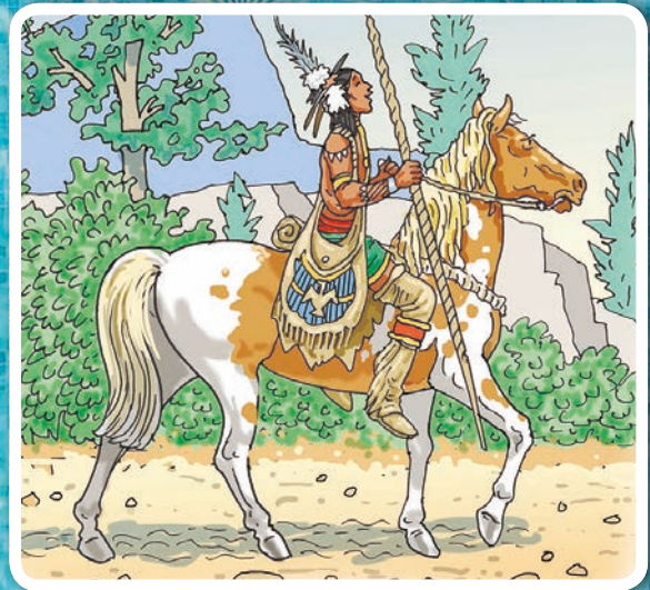
The Fox and the Boastful Brave