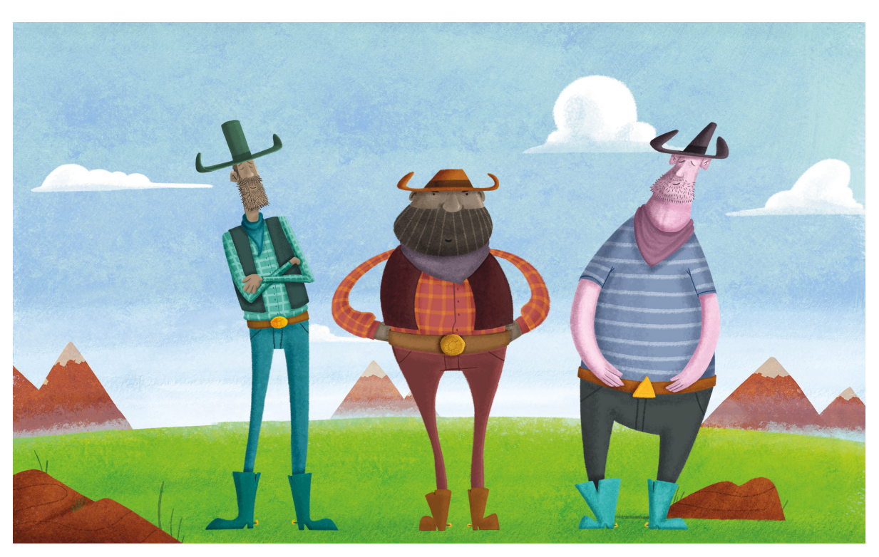
A group of cowboys

Cowboys were needed to move the cattle from one place to another. This could take months, so the cowboys lived and worked together and became friends.