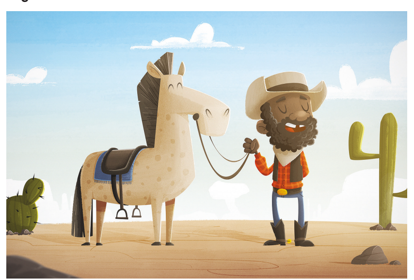
A cowboy with his horse

A long time ago, there were lots of cowboys in North America. Some were young and some were old; most were men and very few were women. They rode horses and looked after cows.