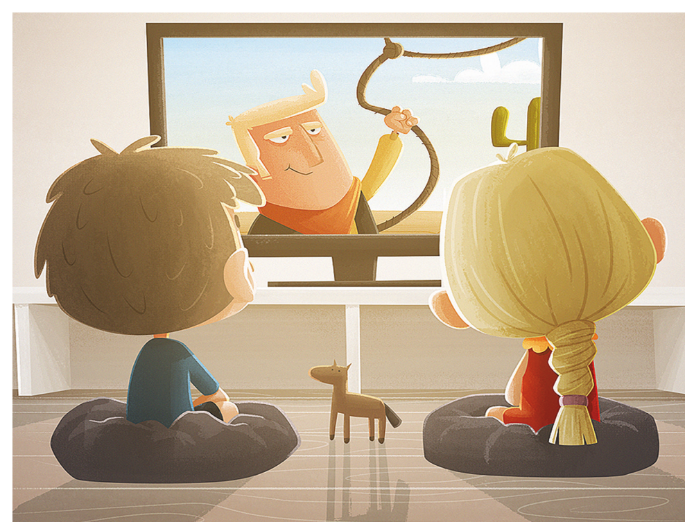
There are many films about cowboys.

In real life, cowboys were often quite old. They were covered in dust and had little time to wash or shave. Usually their horses were more handsome than they were!