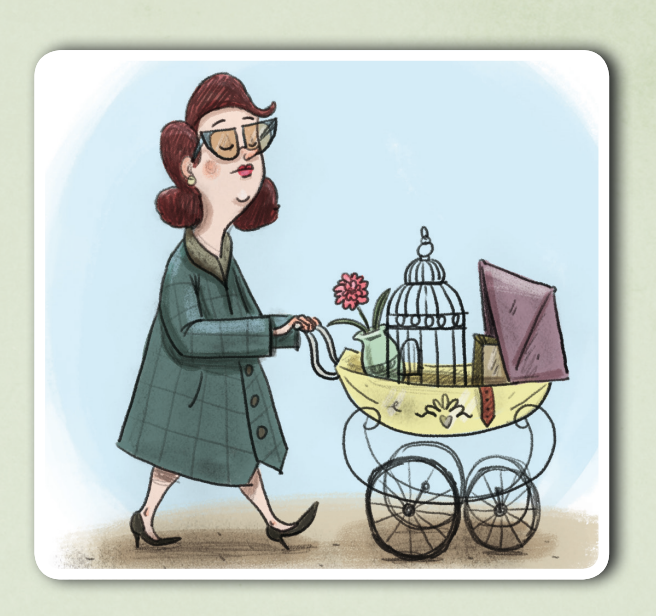
Dora the Storer