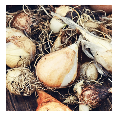
Bulbs ready for planting