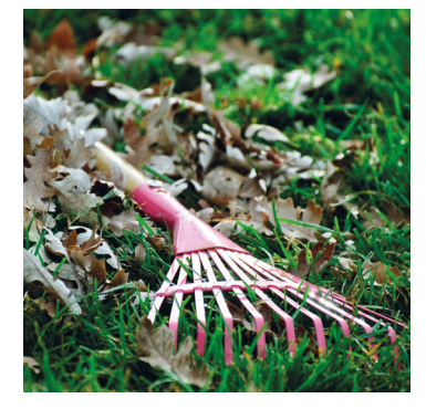
Raking up leaves