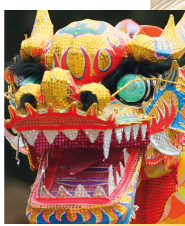
a Chinese dragon puppet