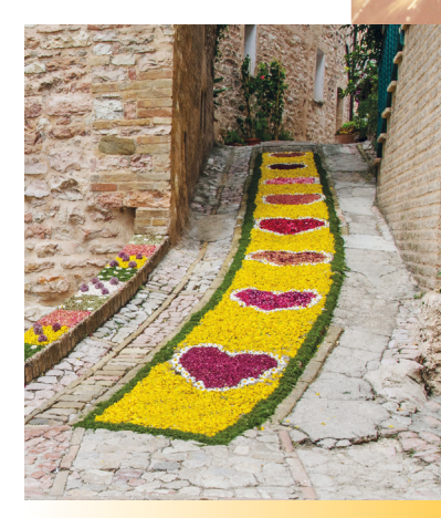
a street covered in flowers

In a country called Italy, people make huge carpets of flowers in the streets. The flowers stay in place for days or even weeks. At the end of the festival, children are allowed to play in the flowers.