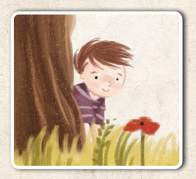
The Hurricane Tree