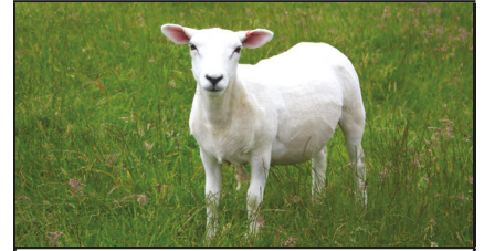
a sheep after shearing