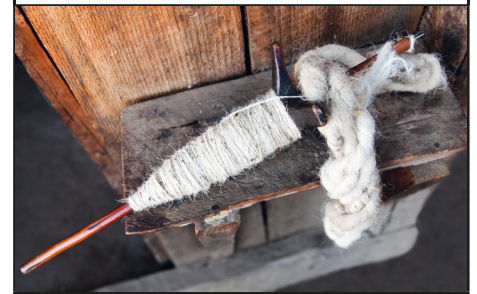
wool being spun