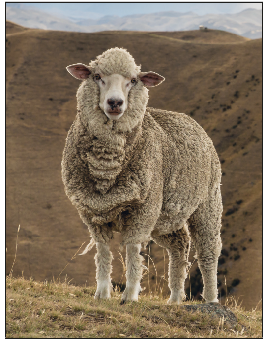
a merino sheep

A special type of wool called merino wool can help keep us cool and dry. It is used to make sports clothes and even clothes for astronauts to keep them comfortable on their journeys through space!