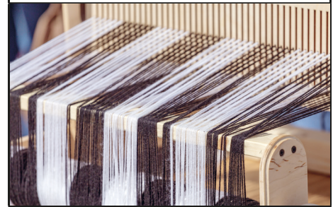
a weaving machine