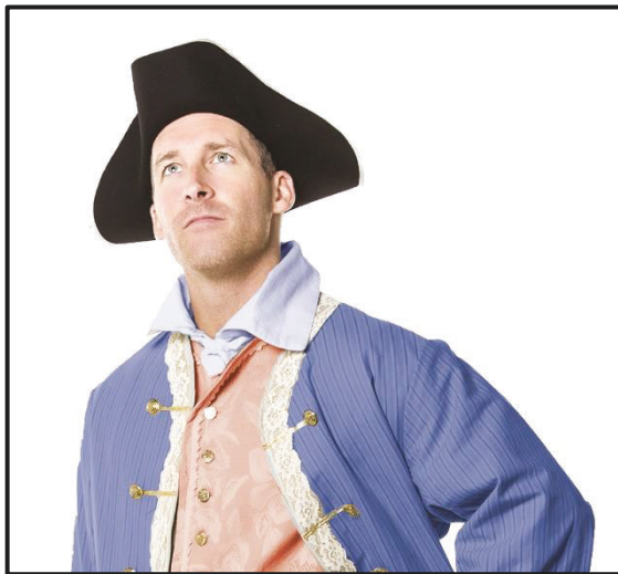
The History of Hats