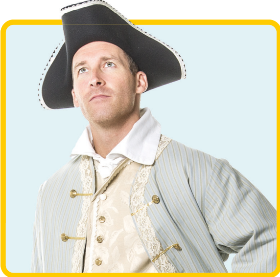
The History of Hats