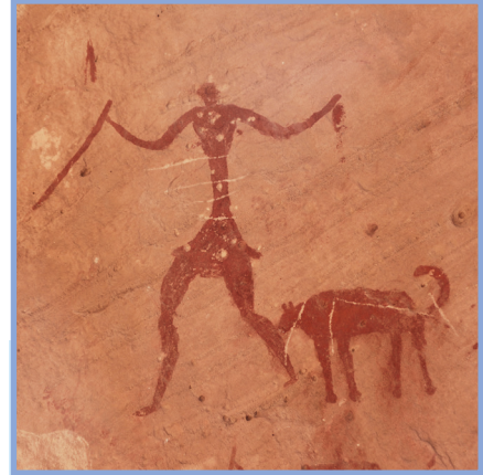
a picture on a cave wall

Today, many people keep animals as pets. If you have a pet, you have to look after it. However, did you know that some animals can look after their owners too?