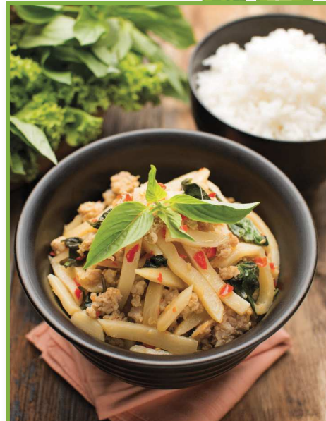
a bamboo stir-fry

We all need to keep our bodies healthy. Bamboo is packed with vitamins that are good for our skin, hair and bones. It's important to cook it carefully because raw bamboo shoots have a poison inside which is dangerous to humans when eaten!