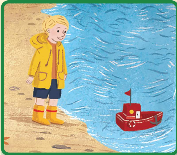
Jack's New Boat