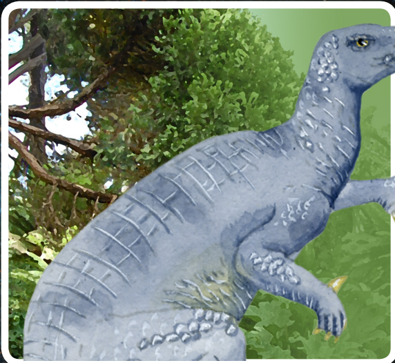
The Lost World