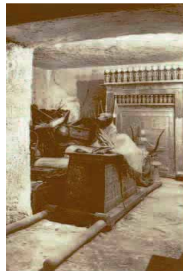
Above: The entrance to the treasury