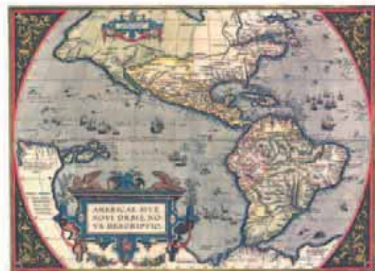
Above: An old map may be the starting point for a lifetime's quest for lost or hidden treasures

Another attraction is the mystery of treasure stashed away and never recovered, for example, pirate gold. Stolen after years of careful planning or taken on the spur of the moment, the treasure had to be concealed and the pirates' tracks covered before it could be retrieved and enjoyed. Often misadventure overtook the pirate before he could return, yet somehow the details of the treasure were passed on, shrouded in ever-greater secrecy.