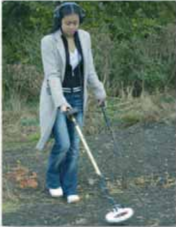
Left: Metal-detecting – one of the more popular forms of treasure-hunting

Two emotions motivate the majority of treasure-hunters. One is the desire to get rich quick: the same feeling that drives people to bet on sporting events or buy lottery tickets, week after hopeless week. This is generally not greed: more the fulfilment of dreams. Who does not wish to be rich? Treasure-hunters sometimes do strike lucky, just as some people win the lottery, but often the time, effort and money invested are greater than the material rewards. So why do it? Probably because of the excitement.