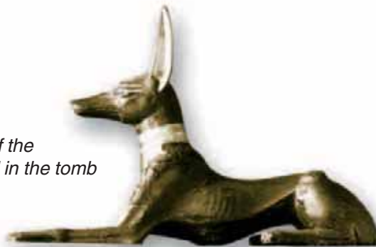
Right: One of the statues found in the tomb