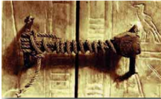
Left: The untouched Burial Chamber seal

Gradually the scene grew clearer, and we could pick out individual objects. First, right opposite to us – we had been conscious of them all the while, but refused to believe in