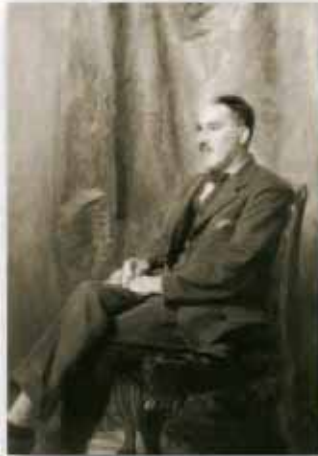
Above: Howard Carter

A t first I could see nothing, because the hot air escaping from the burial chamber caused the candle flame to flicker. Presently, however, as my eyes grew accustomed to the light, details of the room within emerged slowly from the mist: strange animals, statues and gold – everywhere the glint of gold.