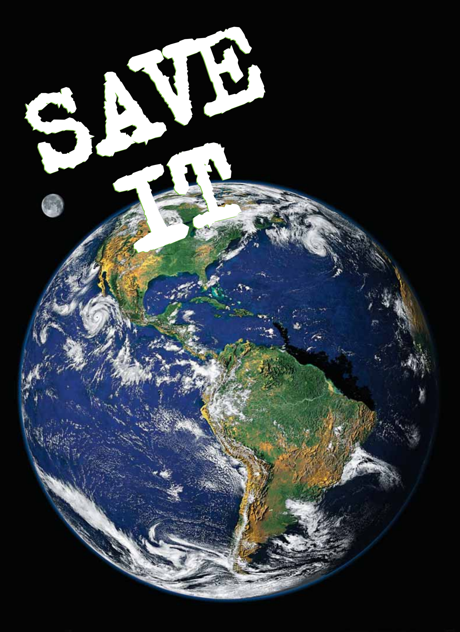
Sourced from SATs-Papers coluk https://www.SATs-Papers.coluk