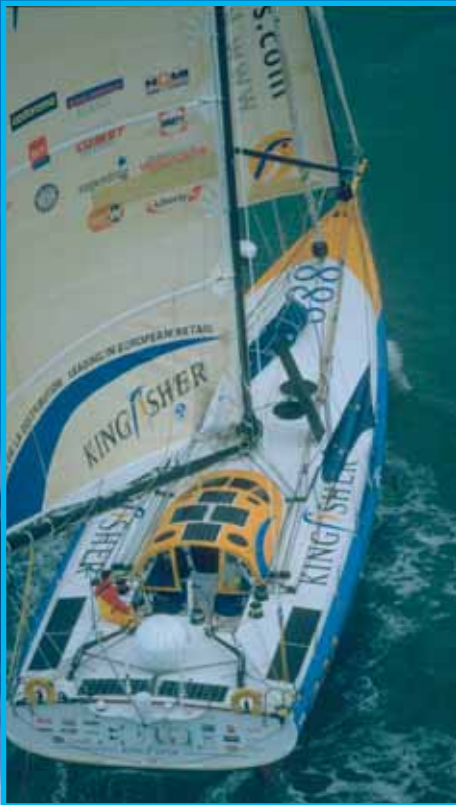
Kingfisher during the race